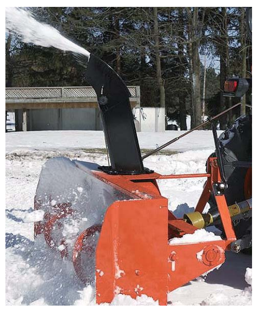
Rear Snow Blower