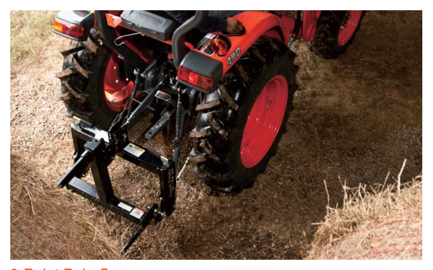
3-Point Bale Spear