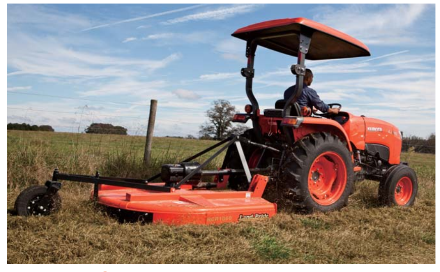
Rear Rotary Cutter