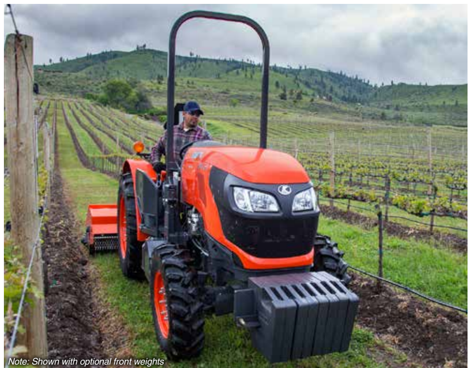
Note: Shown with optional front weights